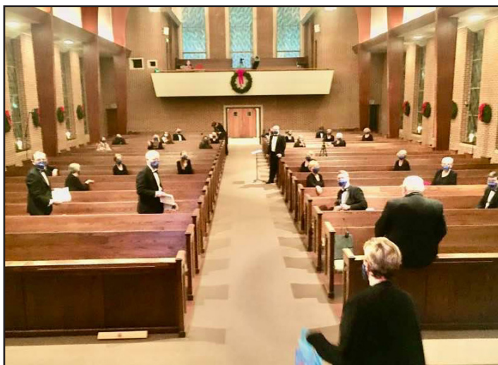
GCA Troops A and B come together to record the double-choir set for “Comfort & Joy.”